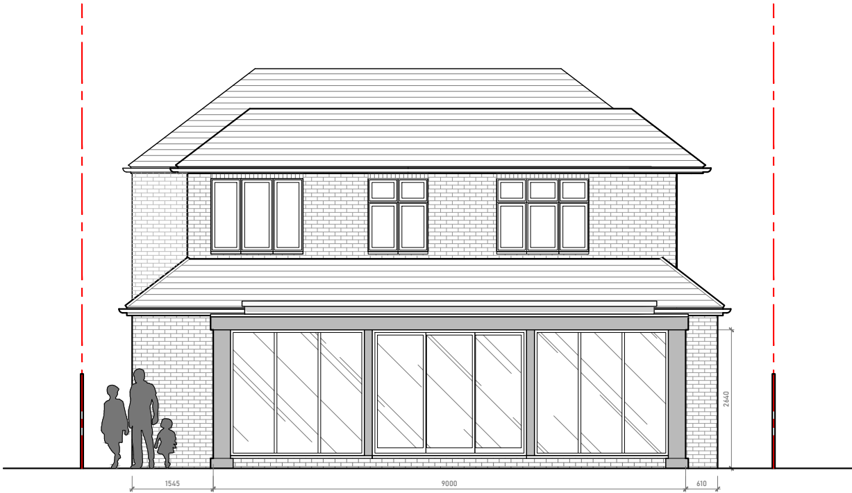
Proposed Rear Elevation Scale 1:100 @ A3