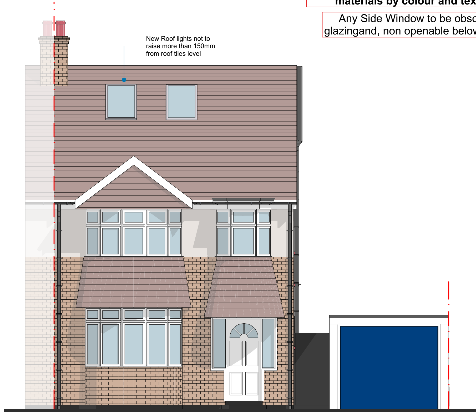
Proposed Front Elevation 1:50

New Roof lights not to raise more than 150mm from roof tiles level